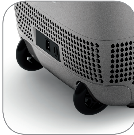
Ruote TB28BT DT Wheels TB28BT DT