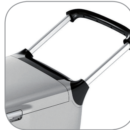
Maniglia estraibile TB28BT DT Extractable drawbars TB28BT DT